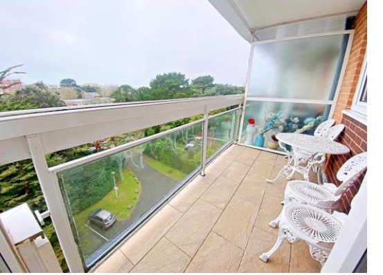
Flat 28 Marchwood, 8 Manor Road East Cliff, Dorset BH1 3EY