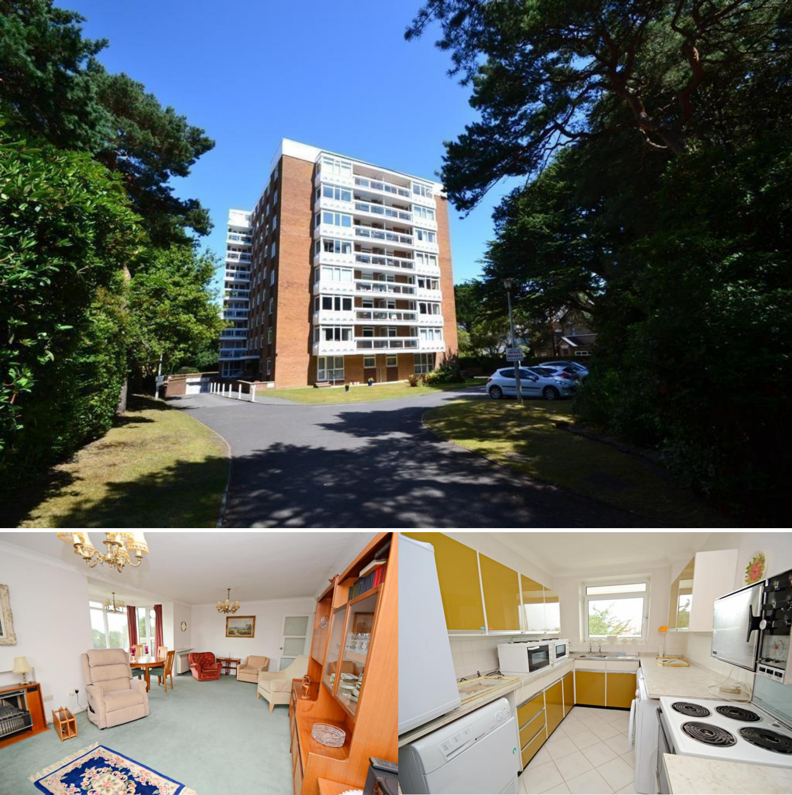
Bournemouth Flat SPACIOUS THREE BEDROOM APARTMENT WITH SOUTH FACING BALCONY